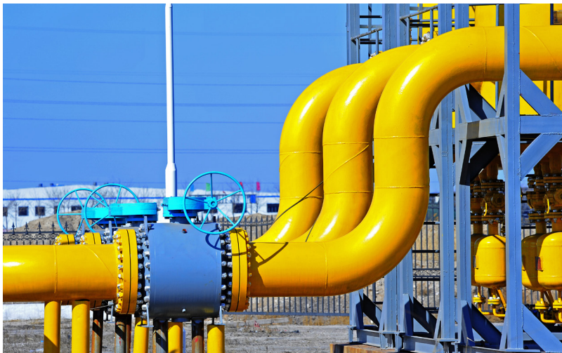
Exhibit on the UK Pavilion and generate new sales leads, increase brand awareness within the European oil & gas market, meet with & sell to existing and new clients and launch new products & services.

Valve World is the world's leading exhibition for fittings and valves. The biennial show is now in its fourth edition and is the most important show for valve technology, piping and flow control professionals.