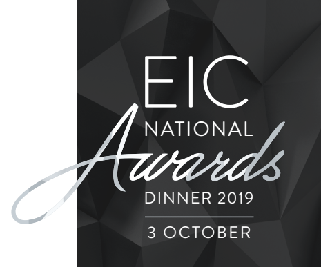
TABLE BOOKING FORM